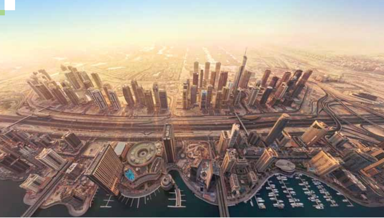
United Arab Emirates (U.A.E) is a country on the west coast of the persian gulf consisting of seven emirates - Abu Dhabi,