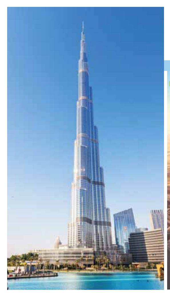
United Arab Emirates, the nation that continues to realise dreams.